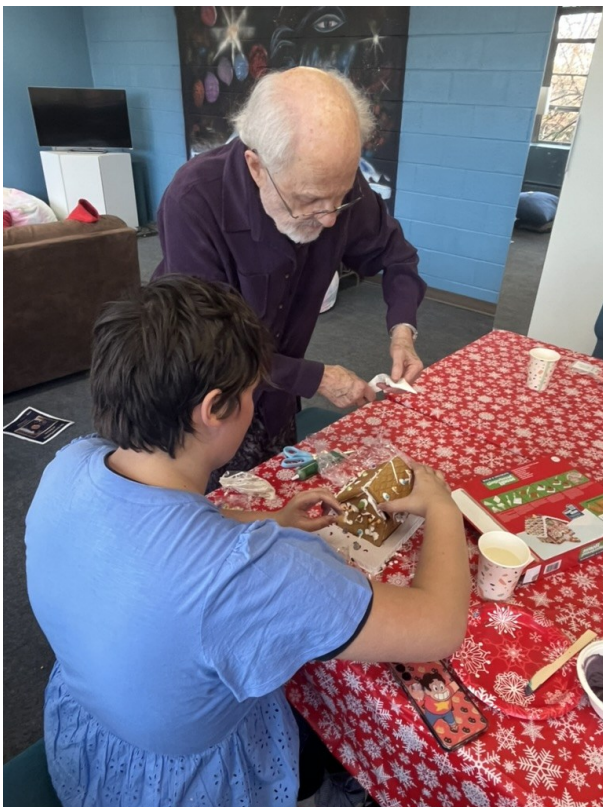
Youth Group building gingerbread houses, December, 2025