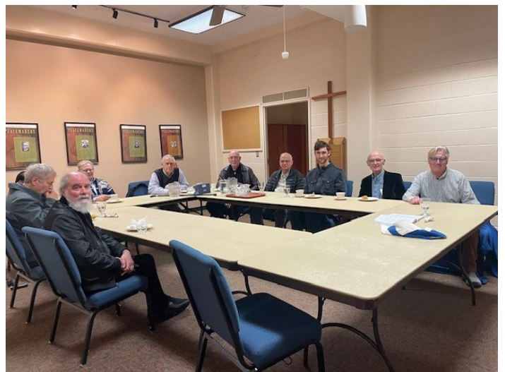
SFBC Men's Group