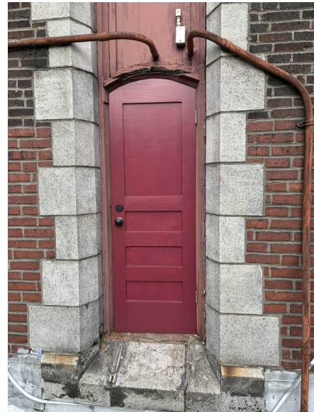
Tower door after