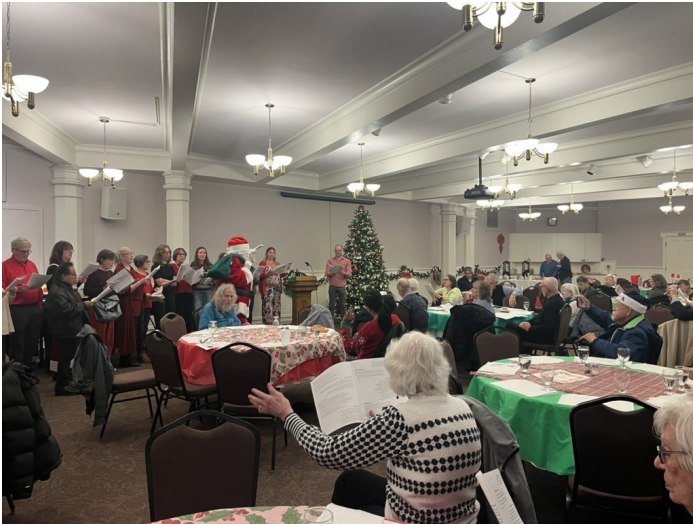
Christmas carol sing-a-long led by our SFBC Sanctuary Choir