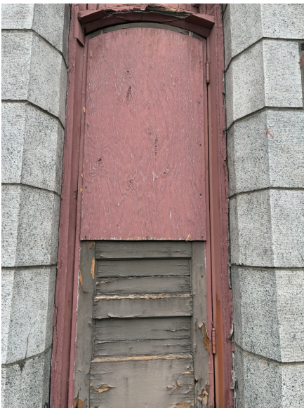
Tower door before