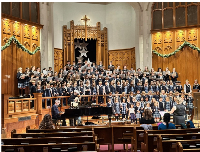
Seattle Classical Christian School, December 8, 2026