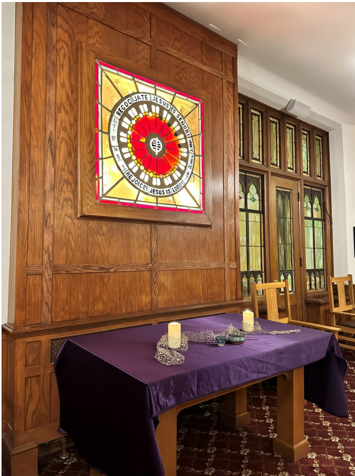
Ash Wednesday in Hintz Chapel, February 18, 2026