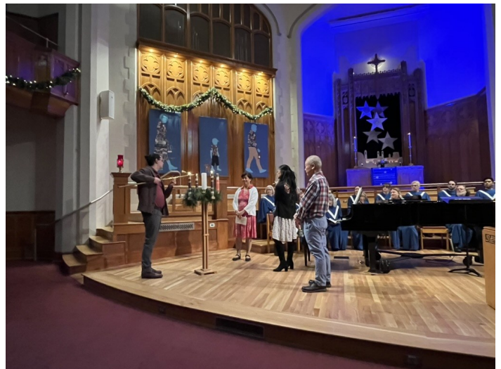
Advent Candle Lighting, December 2025